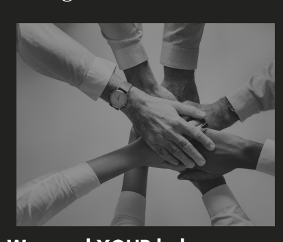
We need YOUR help...

The Subcommittee for the Pre-Symposium Workshop has started planning. We need your help to formulate session ideas, pinpoint speakers, and help with the flow of the workshop.